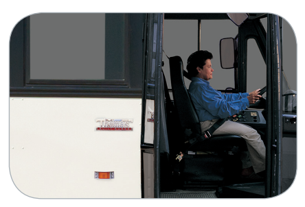
DRIVER IS 4 FEET 11 INCHES