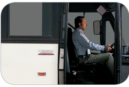
DRIVER IS 6 FEET 8 INCHES