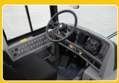
Easy-to-read gauges and an adjustable seat make driving easier.