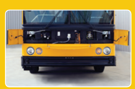
Full-width front access panel allows for easy access.