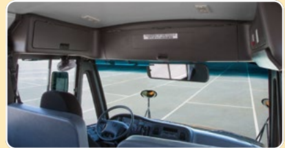
The cockpit features increased overhead storage space and improved interior rearview mirror placement.