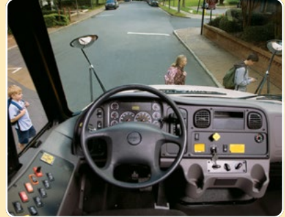
Our largest-in-class windshield increases loading zone visibility to keep your passengers safe.